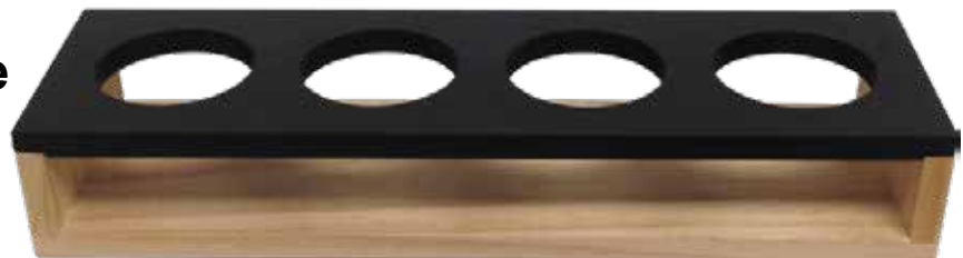
Chalkboard Double Decker Z-CDD4H