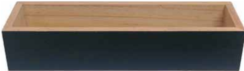
Chalkboard Crate Z-CHALKCRATE