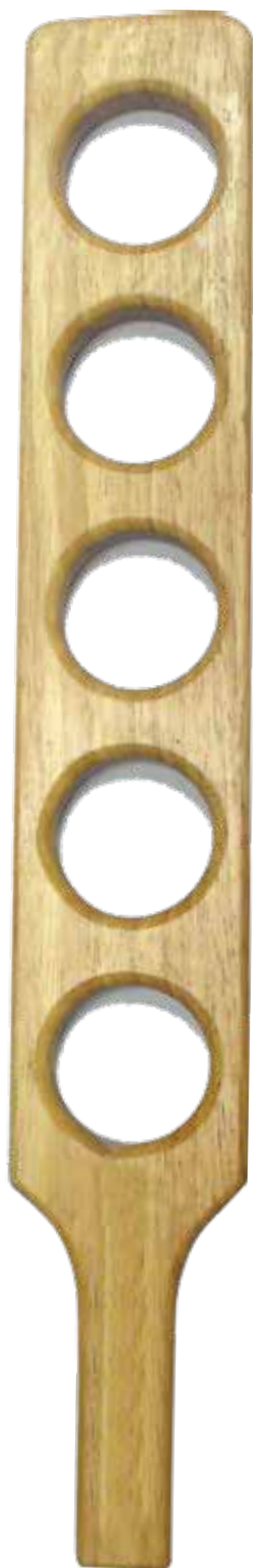
5 HOLE SAMPLER PADDLE