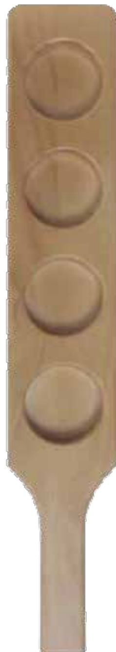
CLOSED BOTTOM SAMPLER PADDLE