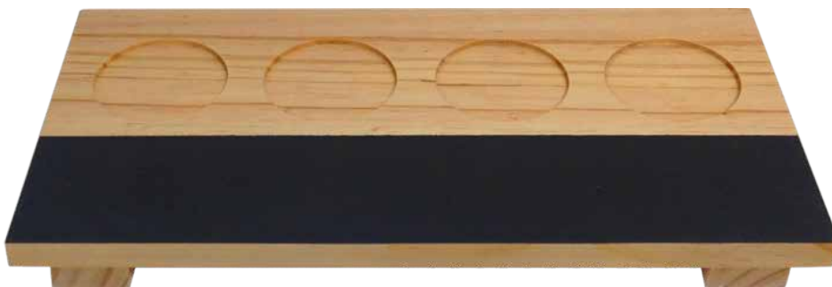
Chalkboard Sampler Tray Z-CBST4H